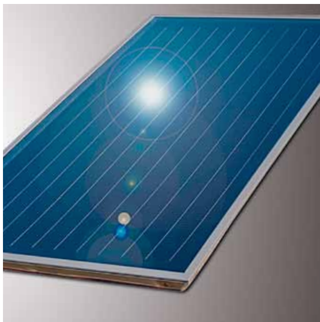
Solar panel with solarclean copper tubes