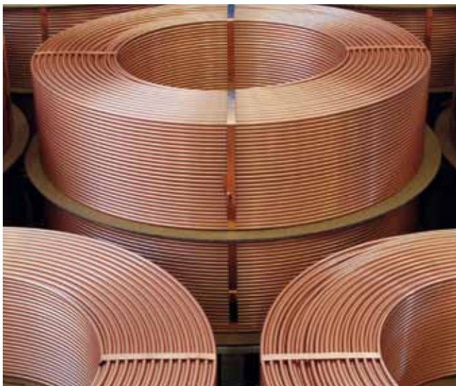
solarclean copper tubes with optimised outer surface